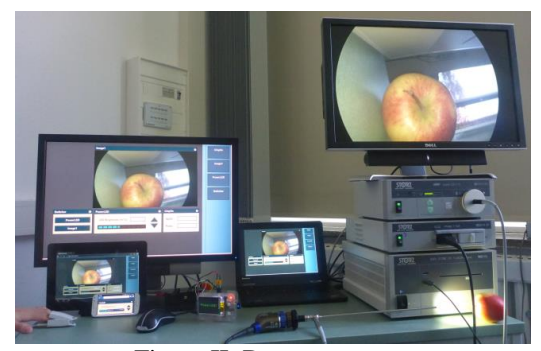
Figure II: Demonstrator

requires no configuration effort and no special hardware from the remote physician, even mobile devices can be used. Physicians can access exactly the information they need for diagnostic purposes or treatment.